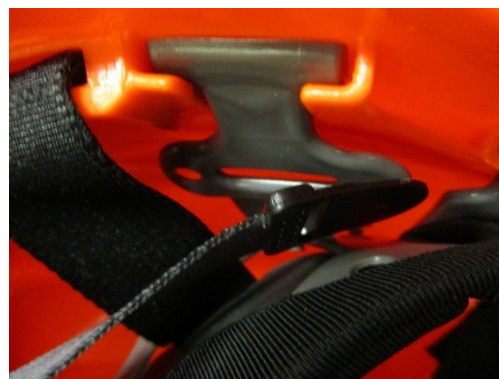
Specimen 01 – chin strap attachment at sides