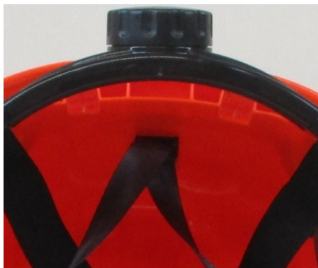
Specimen 01 – chin strap attachment at rear

A chin strap was provided fitted to the shell at the rear and to the harness anchorage at the sides. The harness anchorage attached to both the shell and headband. Pass